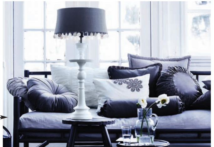
TINE K HOME; www.tinekhome.dk

Unique, individually-designed and hand-crafted products are being revisited and appreciated. From crocheted bags to embroidered pillows and hand-blocked wallpapers, getting crafty is hot. ■