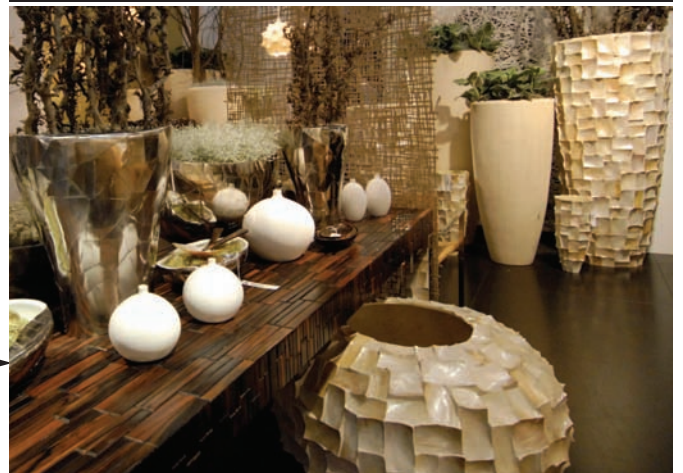
O LIVING; www.o-living.de